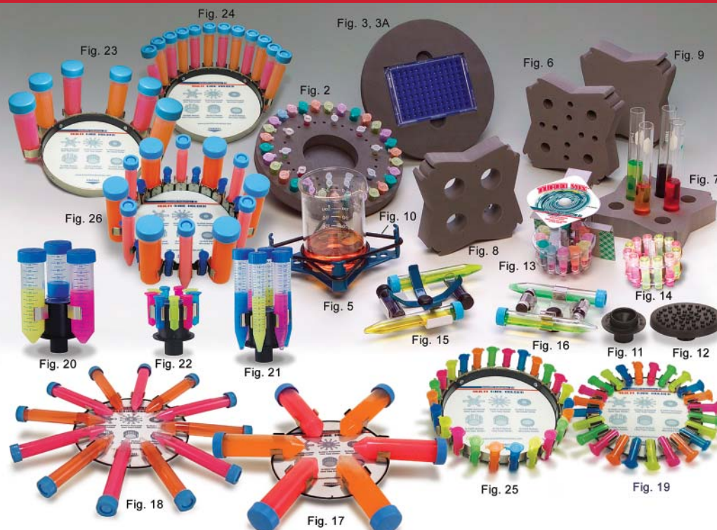
Fig. 1 Model H301 Multiple Sample Starter Set

Accessories for all Vortex-Genie® 2 mixers and Vortex-Genie® Pulse